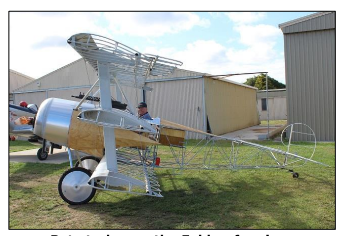
Pete trying on the Fokker for size.